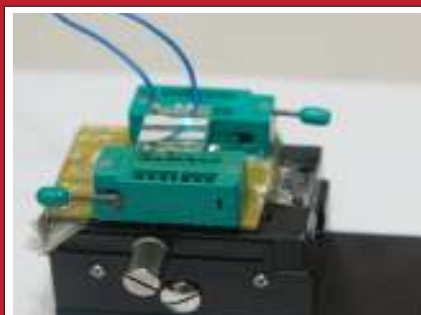
Figure 2 : The OLED uses an organic semiconductor material as an emissive layer