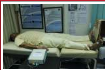
Figure 1 : Performing an analysis via the clinicians mobile applications.

Our current bio-impedance analyzer diagnostic tool, shown in Figure 1, is a general-purpose device that is able to provide bio-impedance analysis. This analyzer is portable, rapid, low-cost, locally made and can be easily customized for specific disease monitoring. Hence, this invention opens a new avenue for the widespread clinical applications of bio-impedance analysis. Our team, for example, is currently developing a wearable non-invasive bio-impedance monitoring device for classifying risk in dengue patients. This new device will provide human body composition information namely water compartments and mass distribution, and will incorporate Artificial Intelligence algorithms for clinical decision support system. In this future prototype, the data will be transferred wirelessly via Bluetooth. Computerized data analysis could then be performed remotely in clinician's mobile application for a particular disease, as envisioned in Figure 2.