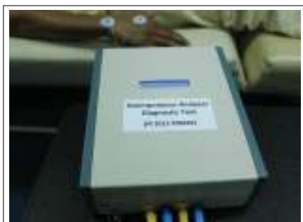
Figure 3 : A non invasive bioimpedance analysis.

The invention can be described as a portable general-purpose bio-impedance analyzer for medical diagnosis. Bio-impedance represents the response of a living body tissue to an externally applied electric current and consists of resistance and reactance components. In biological tissues, resistance arises from extra and intra-cellular fluids whereas capacitive reactance arises from cellular membranes. The measurement of bio-impedance is conducted by passing a sub micro-ampere sine wave current signal through human body and the output of the measurement displays bio-impedance parameters, namely, resistance, reactance and phase angle.