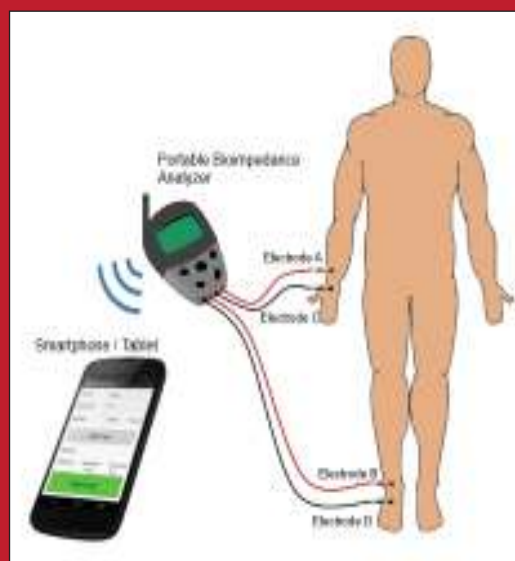
Figure 2 : The Bioimpedance Analyzer, which has been recently granted its patent.