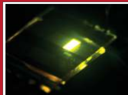
Figure 4 : OLED illuminates a dark surrounding.