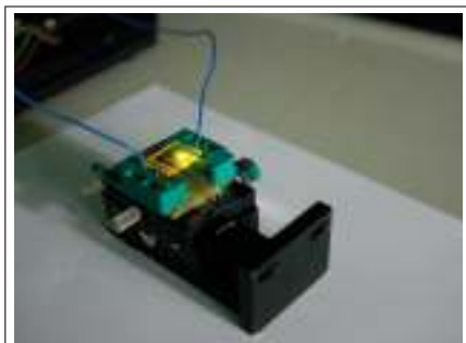
Figure 3 : Emitting superior brightness during the demonstration