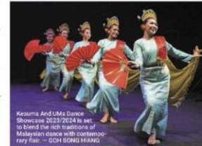
Kesuma And UMa Dance Showcase 2023/2024 is set to blend the rich traditions of Malaysian dance with contemporary flair.

The UMa Dance segment will feature another seven expressive dances, including Terengganu Tawes, and a jazz number.