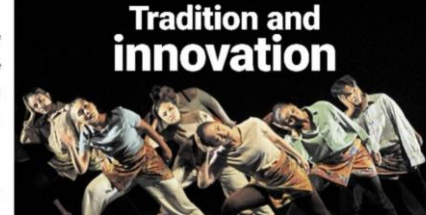
Students, faculty and alumni members of Universiti Malaya ready to blur boundaries at annual dance showcase.

"UMa" on the other hand, was established in 2007 to enable the uni's dance students to showcase contemporary works, featuring new and more challenging choreography. Despite being an emerging company, it has grown into a force to be reckoned with in the local dance sector. The company consists of students as well as alumni, who continue to contribute to their beloved alma mater.