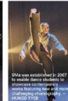
UMa was established in 2007 to enable dance students to showcase contemporary works featuring new and more challenging choreography. — HURIED TYE