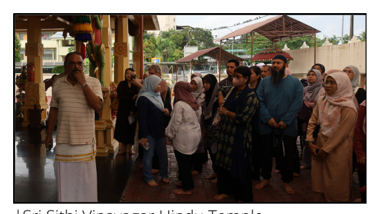
| Sri Sithi Vinayagar Hindu Temple